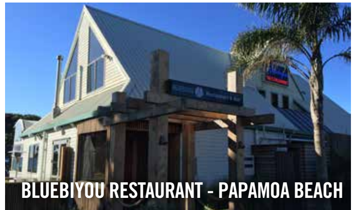
BLUEBIYOU RESTAURANT - PAPAMOA BEACH