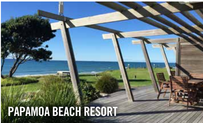
PAPAMOA BEACH RESORT

DINNERS. Are included in the Rallye price every night! From the Welcome Dinner on Wednesday night, until the Wrap-Up Dinner on Monday. So after a long day on the bike, you don't need to worry about having to hunt down some chow - we've got it sorted for you.